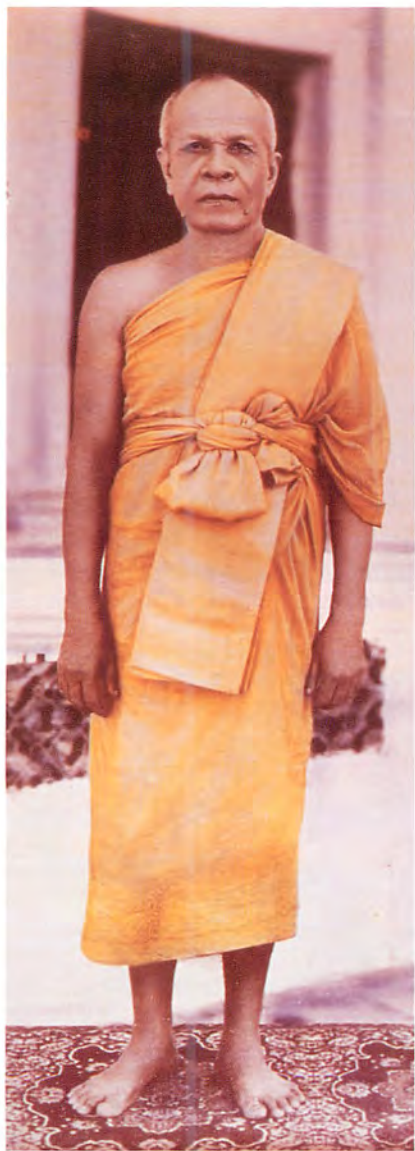
Luang Phaw Wat Paknam Bhasicharoen Phramonkolthepmuni (Sodh Candasaro) (1885-1959) the rediscoverer of the Dhammakaya tradition of medita- tion lost to the world for over two-thousand years.