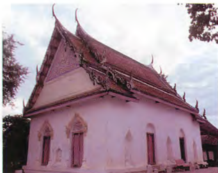
Right: Wat Bangpla, Banglain, Nakorn Pathom, where Luang Phaw gave his first teaching on Dhammakaya and where his first disciple was to attain Dhammakaya in Luang Phaw's footsteps.