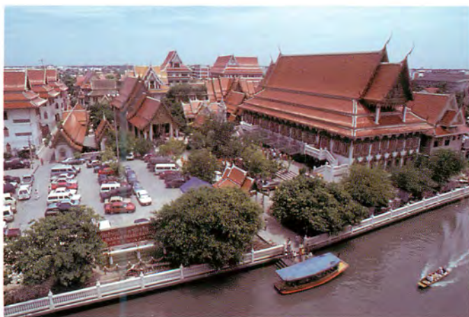
Below: Wat Paknam Bhasicharoen, Thonburi, in the present day, one of the leading Buddhist centres in Thailand.