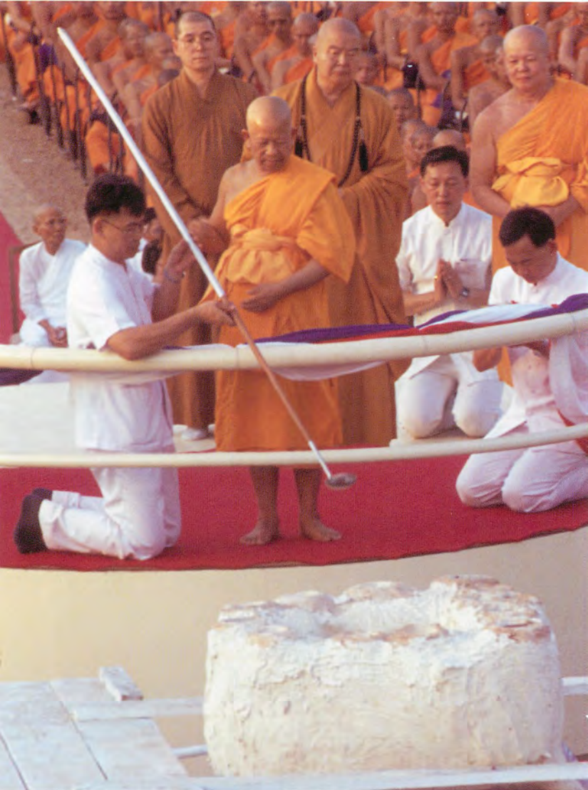
H.E. Somdej Phramaharajamangalacharn (Chuang Varapuñño) [centre], Ven. Master Hsing Yun [right centre] and Phrabhavanaviriyakhun (Phadet Dattajeevo) [right] pour molten gold to cast the image of Luang Phaw Wat Paknam at the World Dhammakaya Centre (WDC.), Wat Phra Dhammakaya, Patumthani province, Thailand on 25 February 1994.